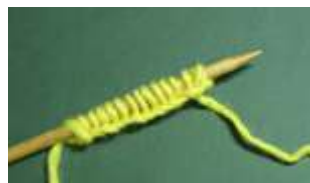
Front of needle

Keep this first stitch loose, even though it wants to tighten and cross in front of the second stitch