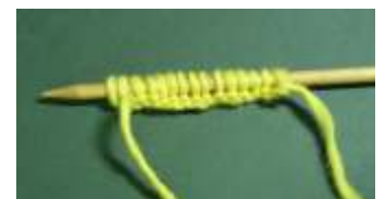
Back of needle